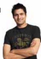
Danny Bhoy, comedian, is proud to support work of MCFB